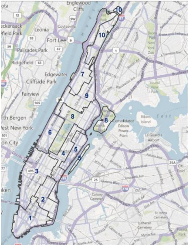
Figure 1: Map of Manhattan Council Districts