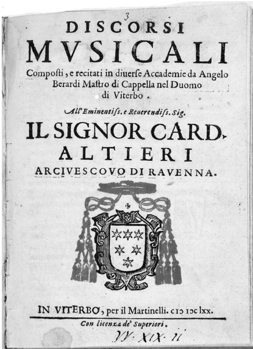
Figure 1a Title page of Angelo Berardi's Discorsi musicali (Viterbo, 1670), exemplar from Rome, Biblioteca Casanatense, Vol. Misc. 657.3. Used by permission. This figure appears in color in the online version of the Journal.